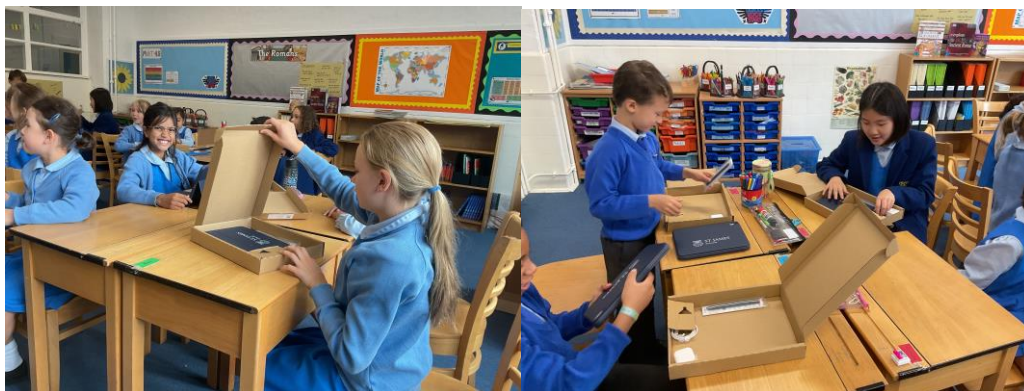
We were very excited to unbox our new iPads!