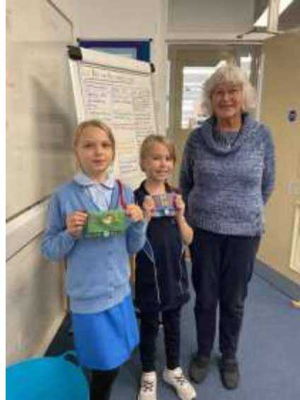
Some of our completed bags in sewing.